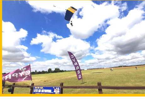
Year 11 scholars completed the annual charity skydive at Ellough Airfield on 3 July after weather conditions delayed the jump by a day.